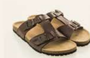
SANDALS & SLIPPERS